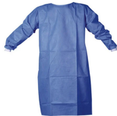
Non sterile isolation gowns 50GSM