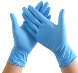
Examination Nitrile gloves