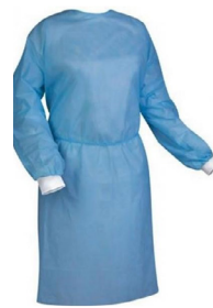
Sterile Isolation gowns 50 GSM