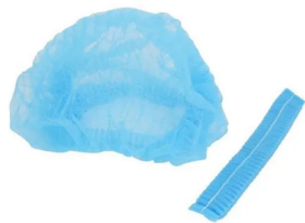
Disposable non-woven polypropylene head covers/ Bouffant caps 25GSSM