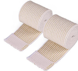
Elastic cotton bands