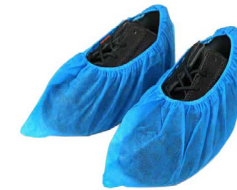
Disposable non-woven polypropylene shoe covers 25GSM