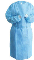
Disposable non- woven polypropylene surgical gowns 50GSM