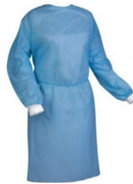
Sterile Isolation gowns 50 GSM