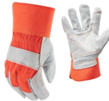
PVC Leather Gloves