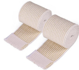
Elastic cotton bands