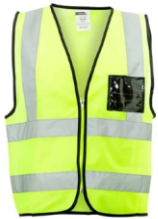
Reflective Safety Vests