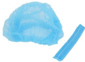
Disposable non-woven polypropylene head covers/ Bouffant caps 25GSSM