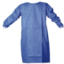
Non sterile isolation gowns 50GSM