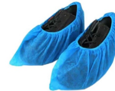
Disposable non-woven polypropylene shoe covers 25GSM