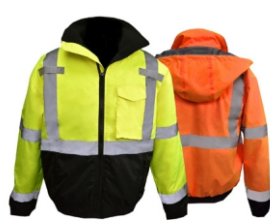
Reflective Safety Jackets