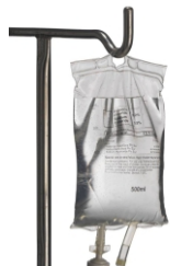
IV Drip Bags