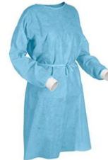
Disposable non- woven polypropylene gowns 45 GSM