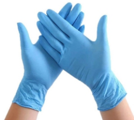
Examination Nitrile gloves