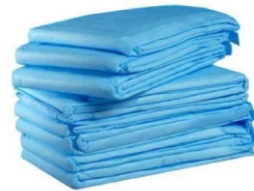
Linen savers 4ply Linen savers 6ply