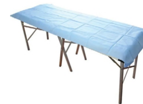
Disposable flat bed sheets 65GSM Disposable fitted bed sheets 65GSM