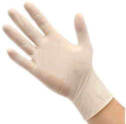
Latex gloves (powdered & powder-free)