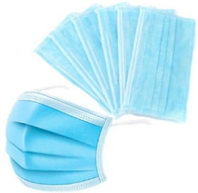
Surgical face masks 65 GSM